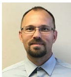
Nicholas Thomas Wilson & Company